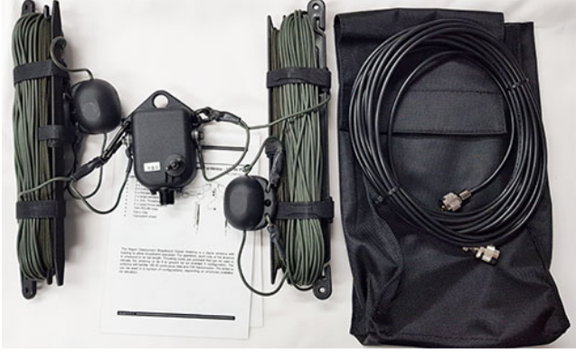
Unpacked Tactical MIL-2E Broadband Dipole

Throwing weights & cords are provided, which can be used to elevate the antenna.