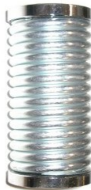
Zinc plated mounting spring with internal connector wire between end the plates. Height: 110mm Weight:~750gm

NB: All tapped whips require a base fitted with a PL259 (see left) and a mounting spring, for collision and vibration protection. Antennas and accessories have 1/2" BSW threads.