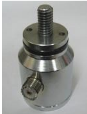
Heavy Duty chromed plate Brass Base Height: 58mm Weight: ~500gm