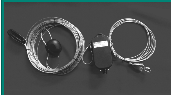
SWE-100K 24 metre single wire end fed HF broadband antenna with optional quick deployment accessories.